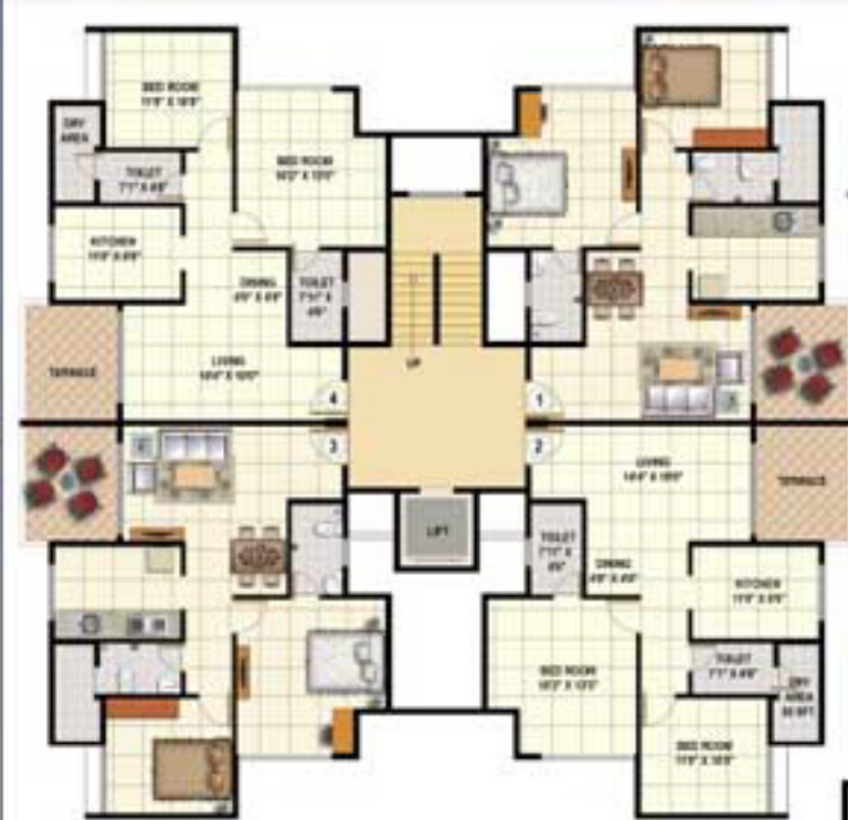
◀ 1ST , 3RD, 5TH, 7TH FLOOR PLAN