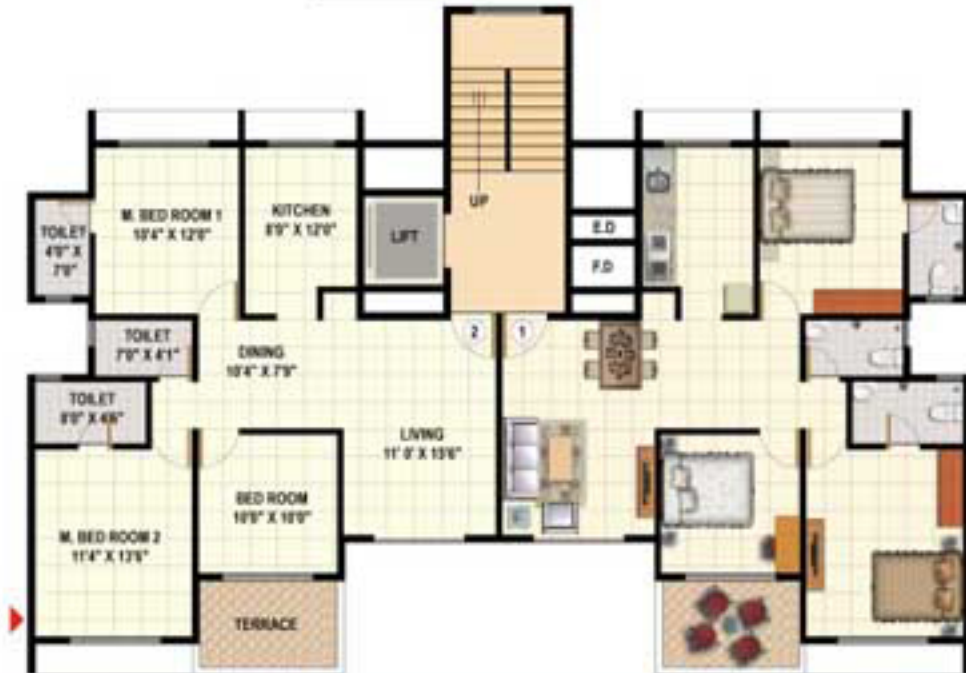
2nd, 4th, 6th FLOOR PLAN ▶