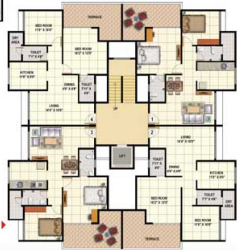
2nd, 4th, 6th FLOOR PLAN ▶