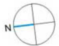
◀ 1ST, 3RD, 5TH, 7TH FLOOR PLAN