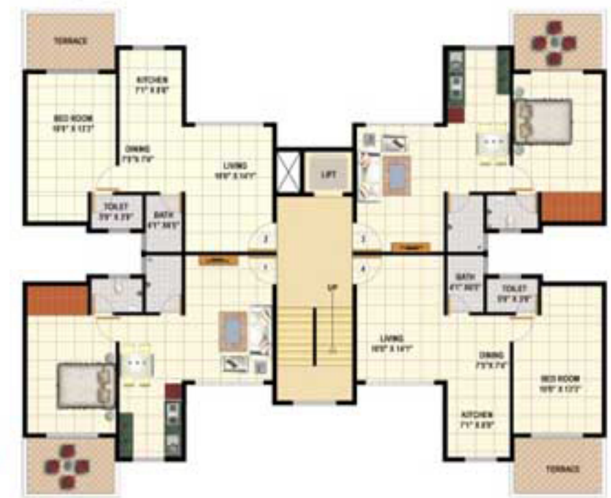
2nd, 4th, 6th FLOOR PLAN ▶